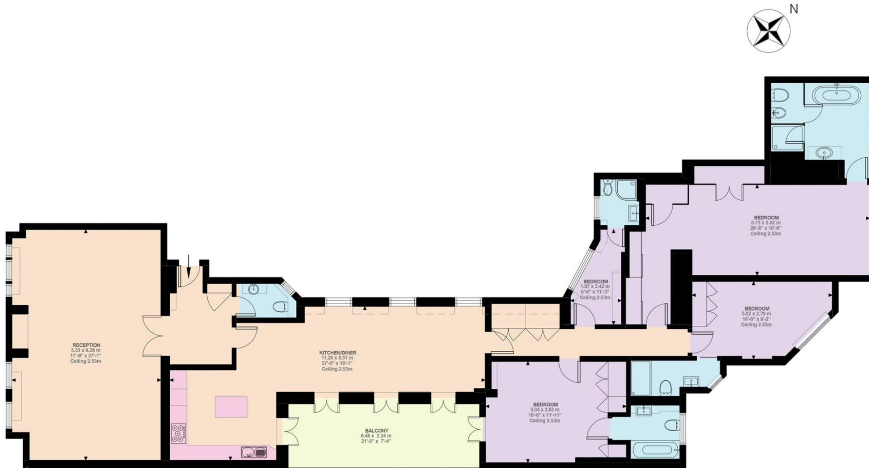
Fifth Floor 2175 ft²

Queens Gate, SW7 Approximate Gross Internal Area = 202.08 sq m / 2175sq ft