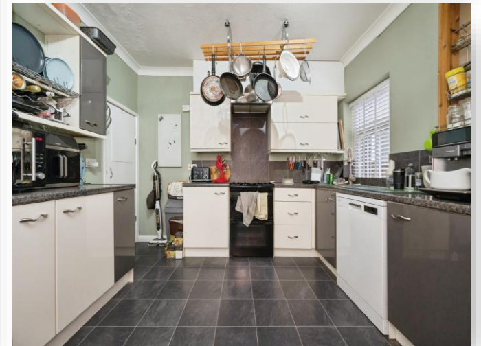
Weston Grove Road, Southampton SO19 9EL