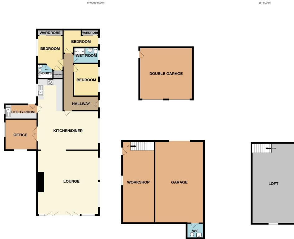
THE SPINNEY, 38 HIGH STREET, NORTH SCARLE, LN6 9EP

Whilst every attempt has been made to ensure the accuracy of the floorplan contained here, measurements of doors, windows, rooms and any other items are approximate and no responsibility is taken for any error, omission or mis-statement. This plan is for illustrative purposes only and should be used as such by any prospective purchaser. The services, systems and appliances shown have not been tested and no guarantee as to their operability or efficiency can be given. Made with Metropix ©2025