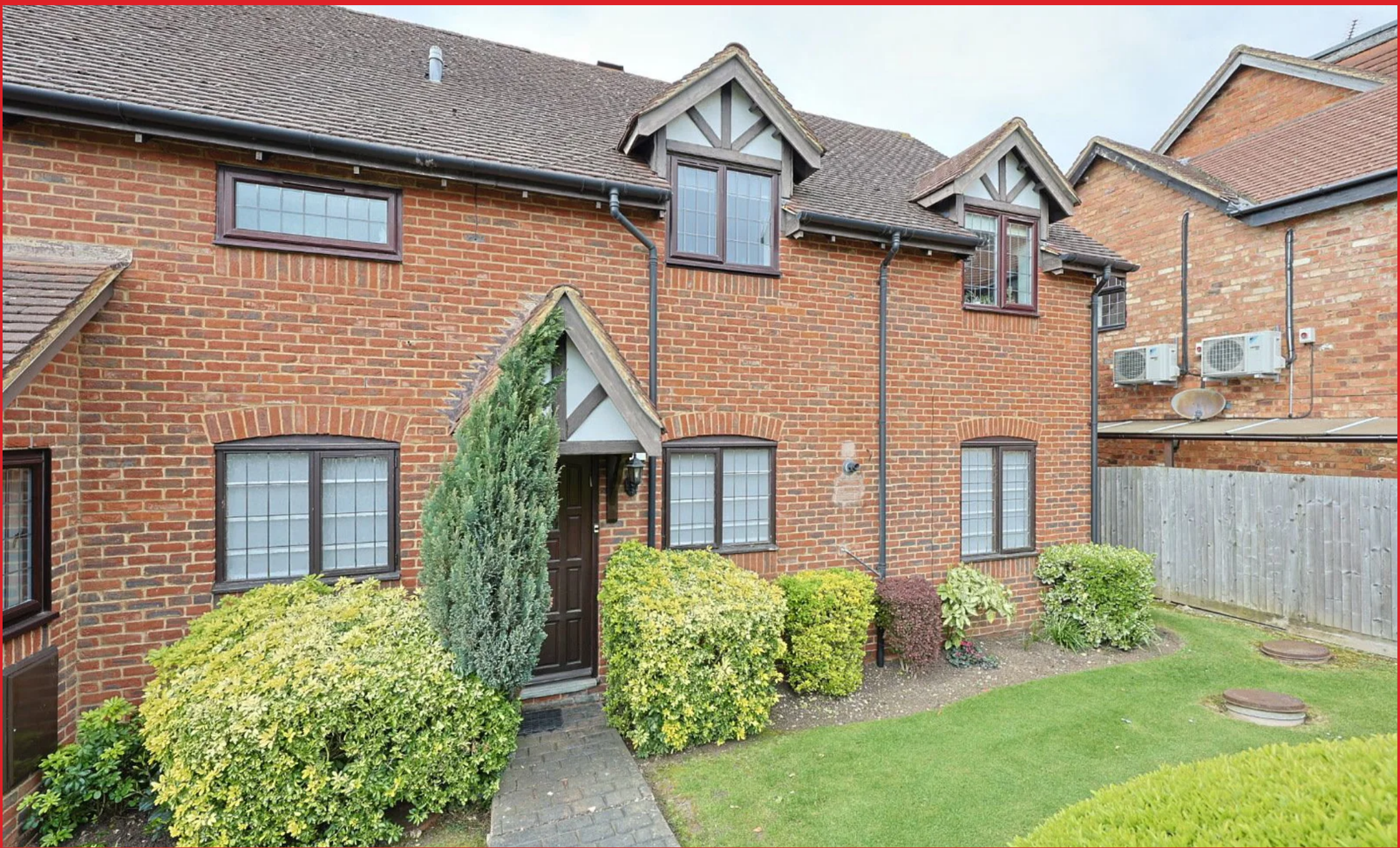
Priory Field Drive, Edgware Edgware