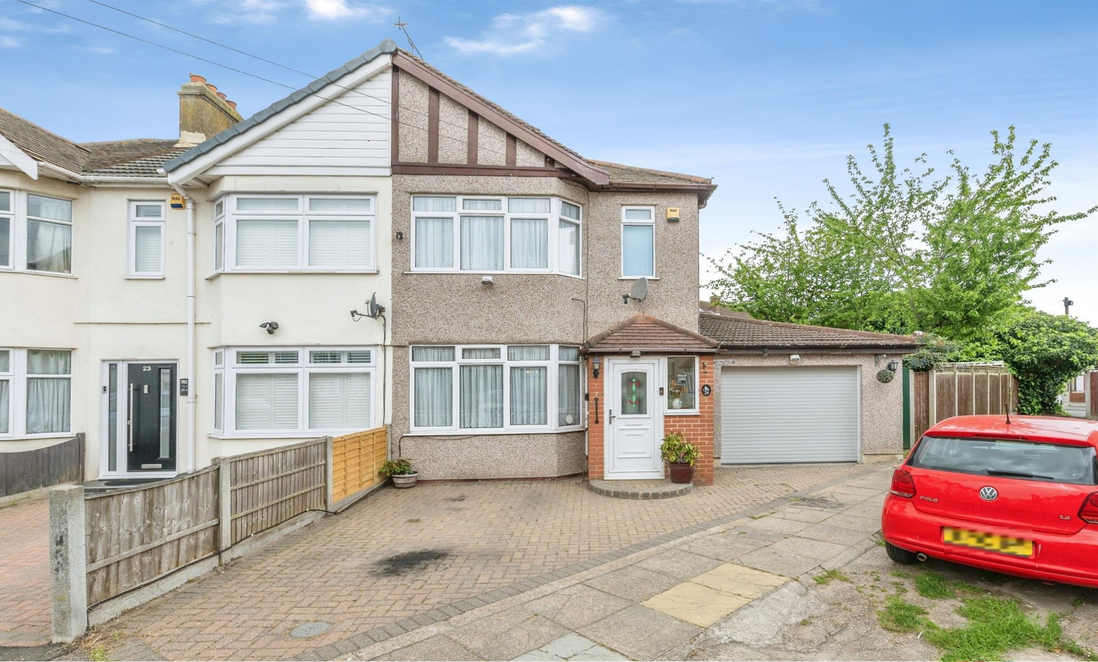
Cherry Tree Close, Rainham, RM13 7QU