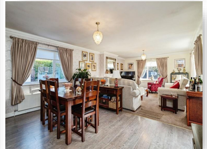
Malts Lane, Hockwold, Thetford, IP26 4LA