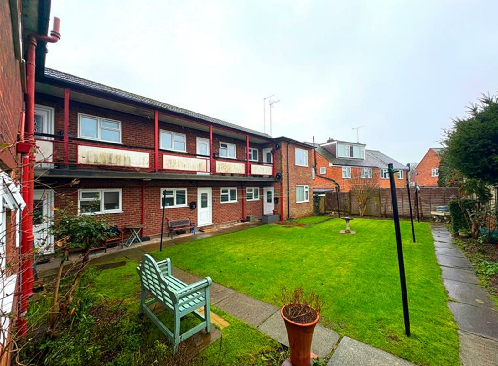
Mason Road, Redditch