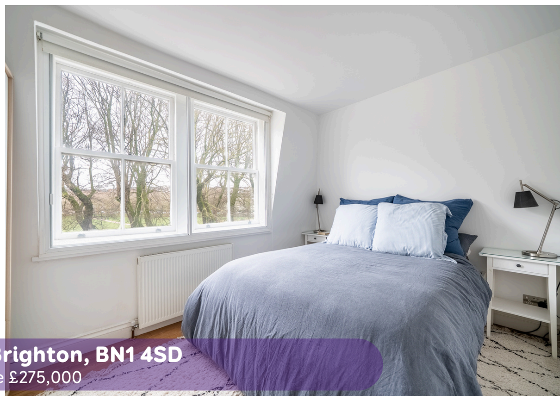
Ditchling Road, Brighton, BN1 4SD Asking Price £275,000