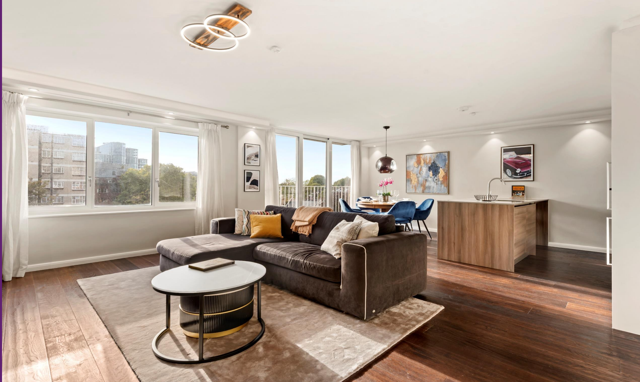
Abbots House St. Mary Abbots Terrace, W14