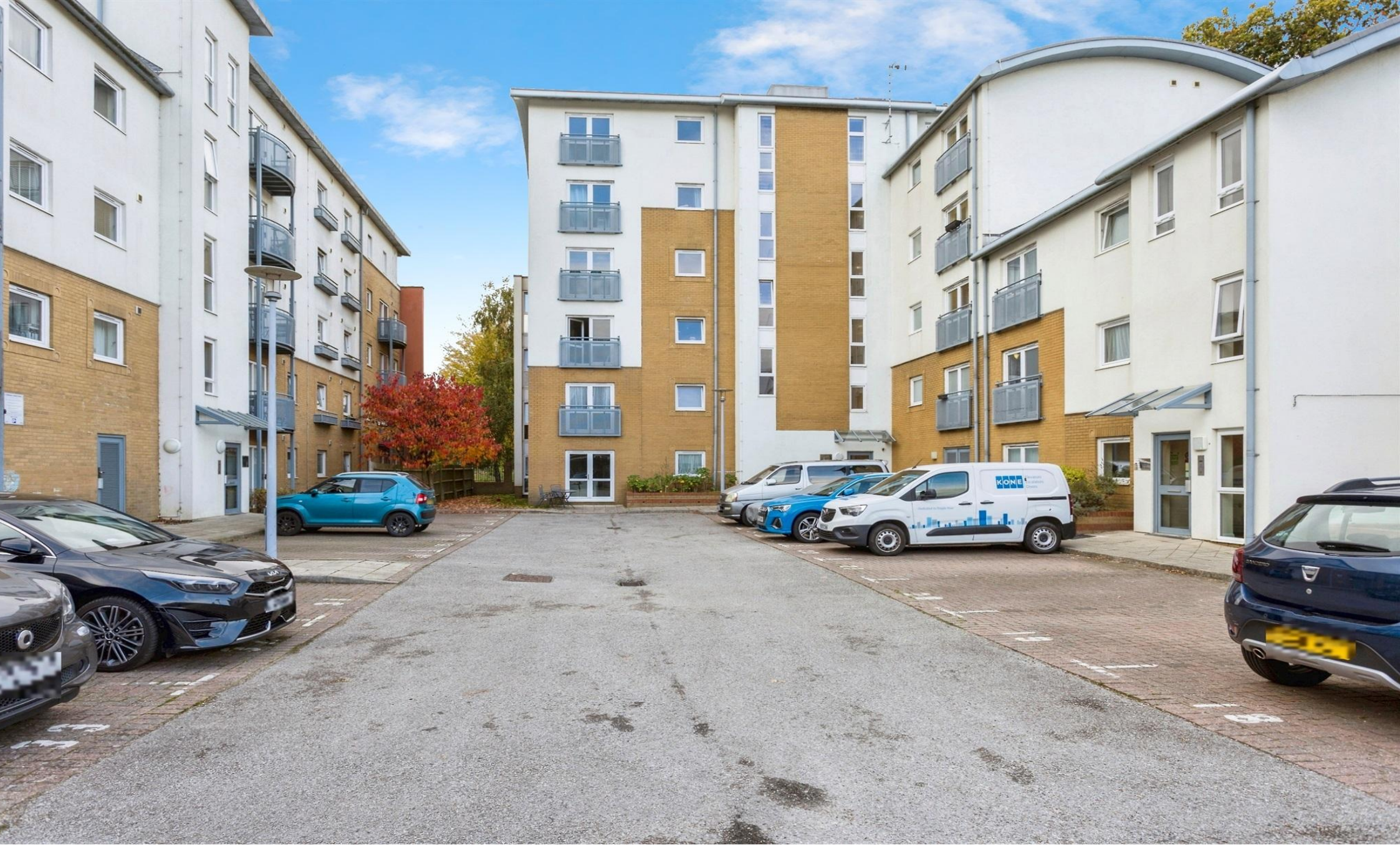
Daniels House Trafalgar Gardens,Crawley RH10 7SR