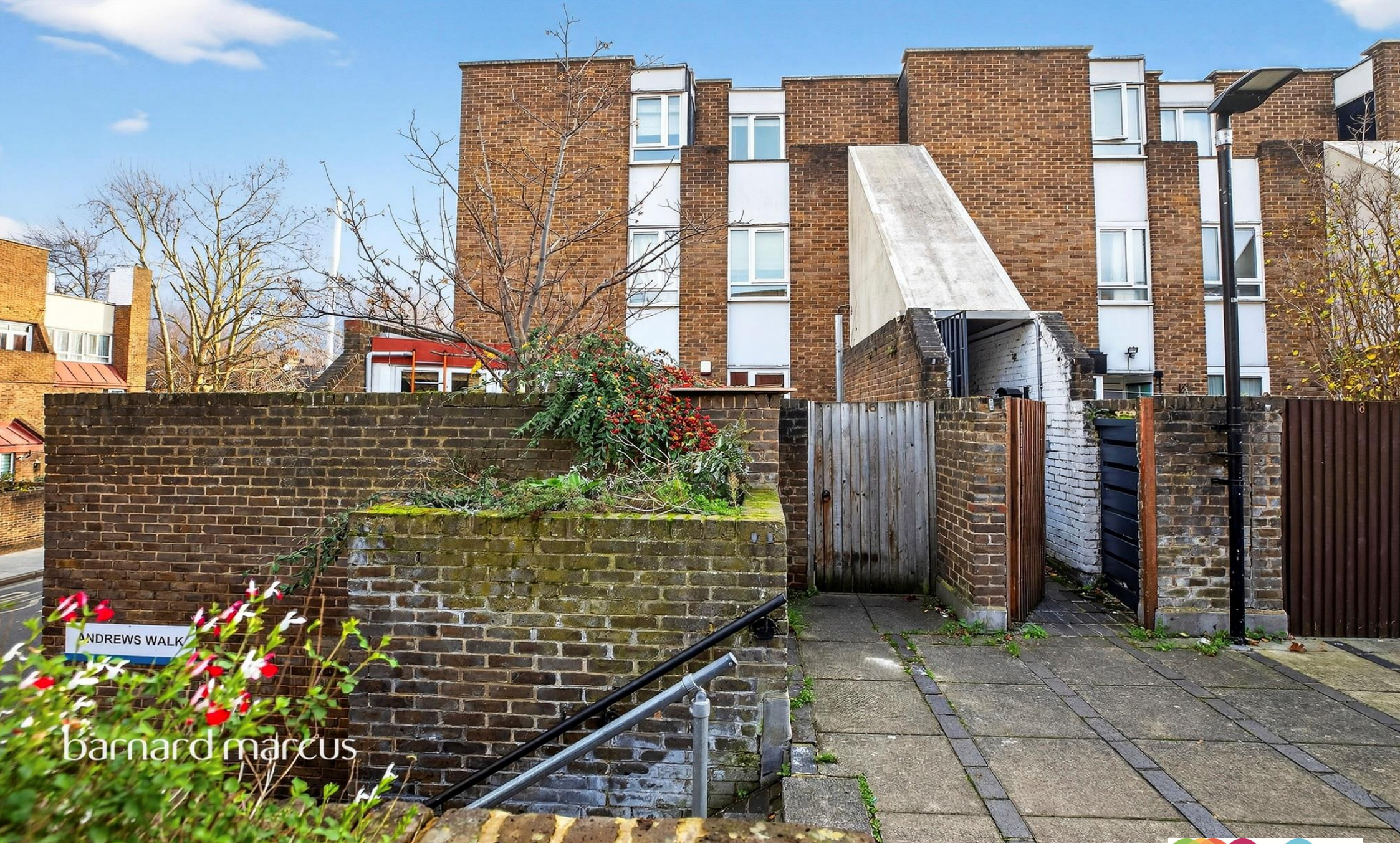
Andrews Walk, London SE17