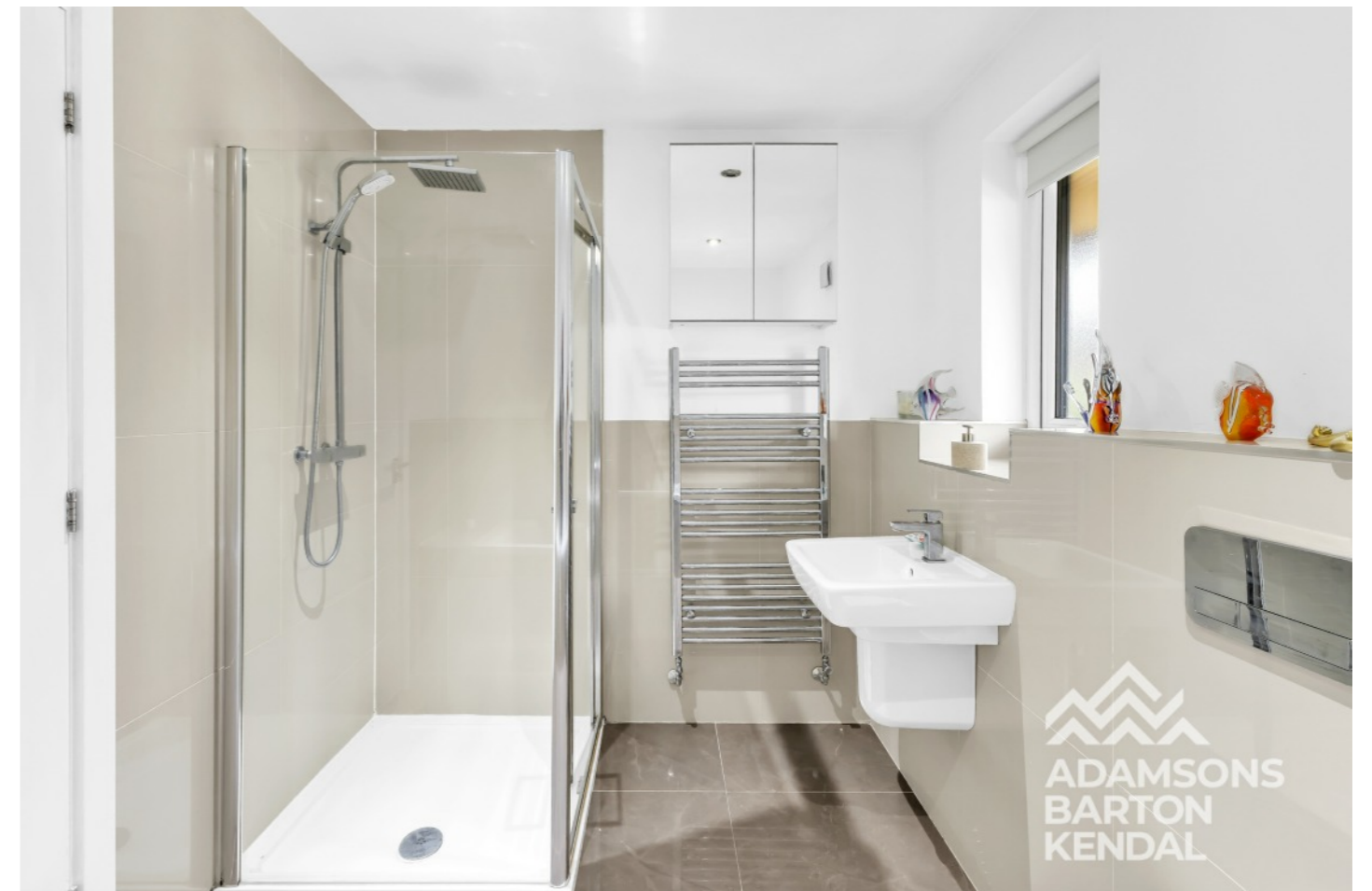
Heather Lea Close, Heywood OL10 2QT