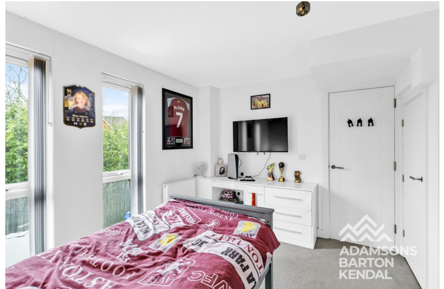
Heather Lea Close, Heywood OL10 2QT