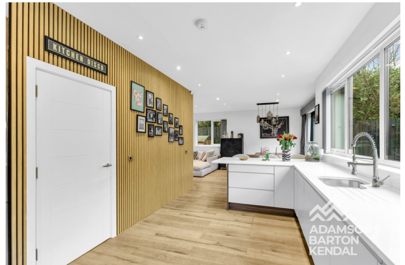
Heather Lea Close, Heywood OL10 2QT