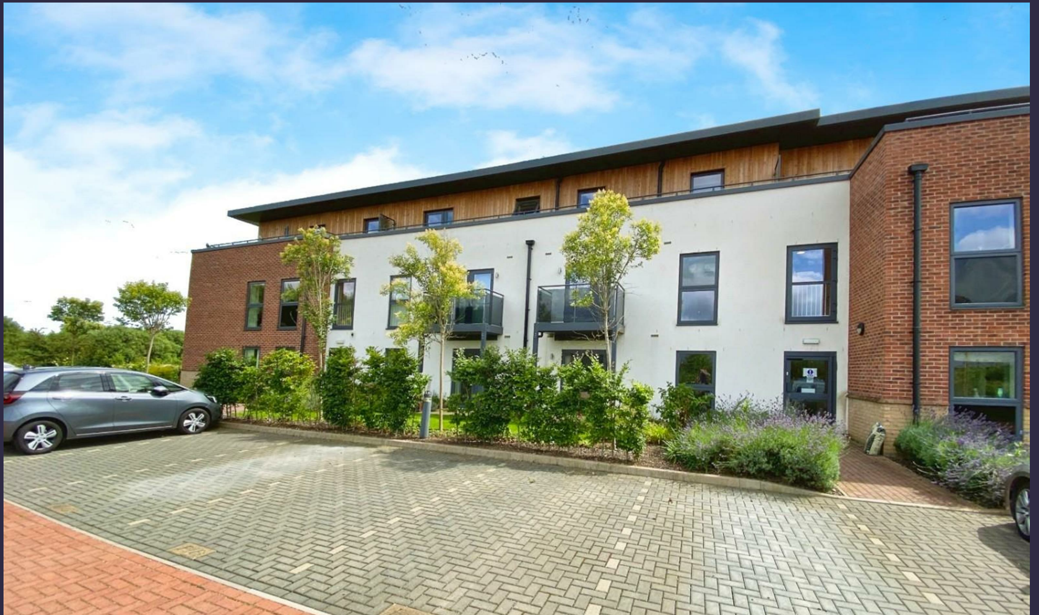
23 Harvard Place Springfield Close, Stratford-upon-Avon, CV37 8GA