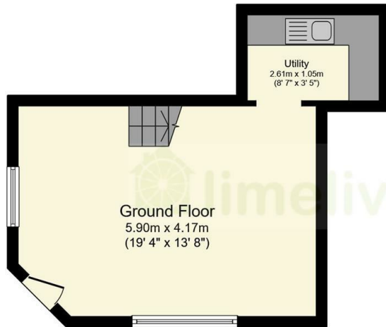
Ground Floor Floor area 28.6 sq.m. (308 sq.ft.)