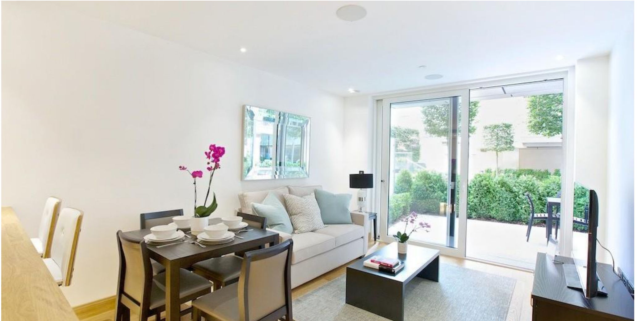
THE COURTHOUSE, Westminster SW1P