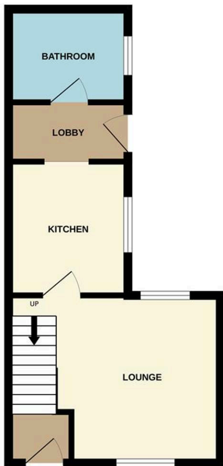
GROUND FLOOR 311 sq.ft. (28.9 sq.m.) approx.