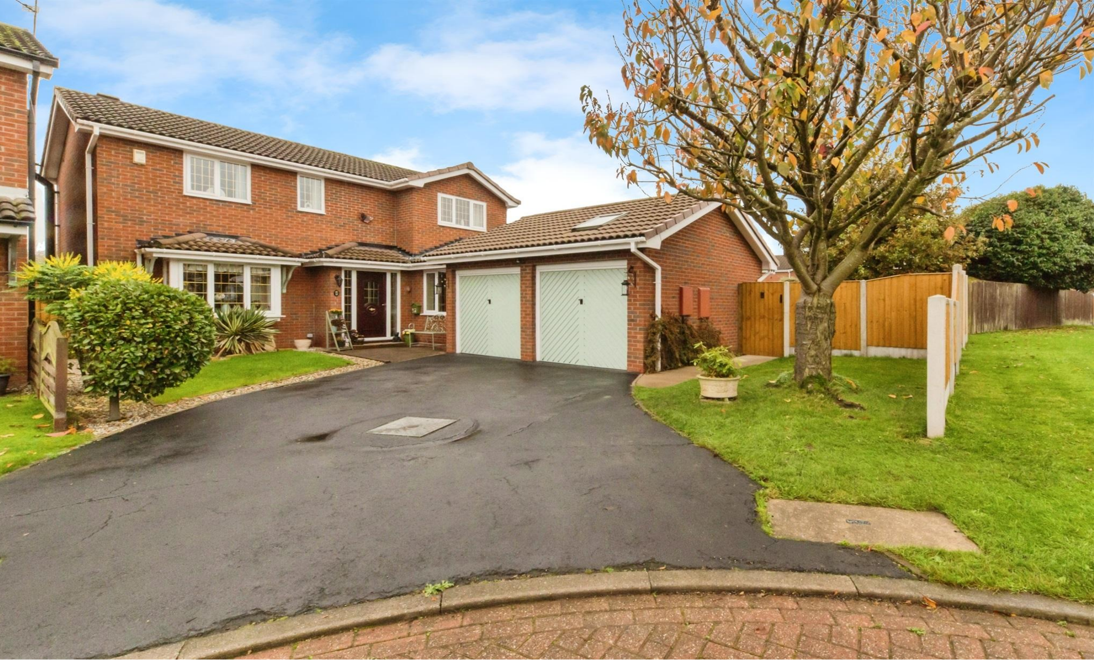
Spey Close, Winsford CW7 3BP