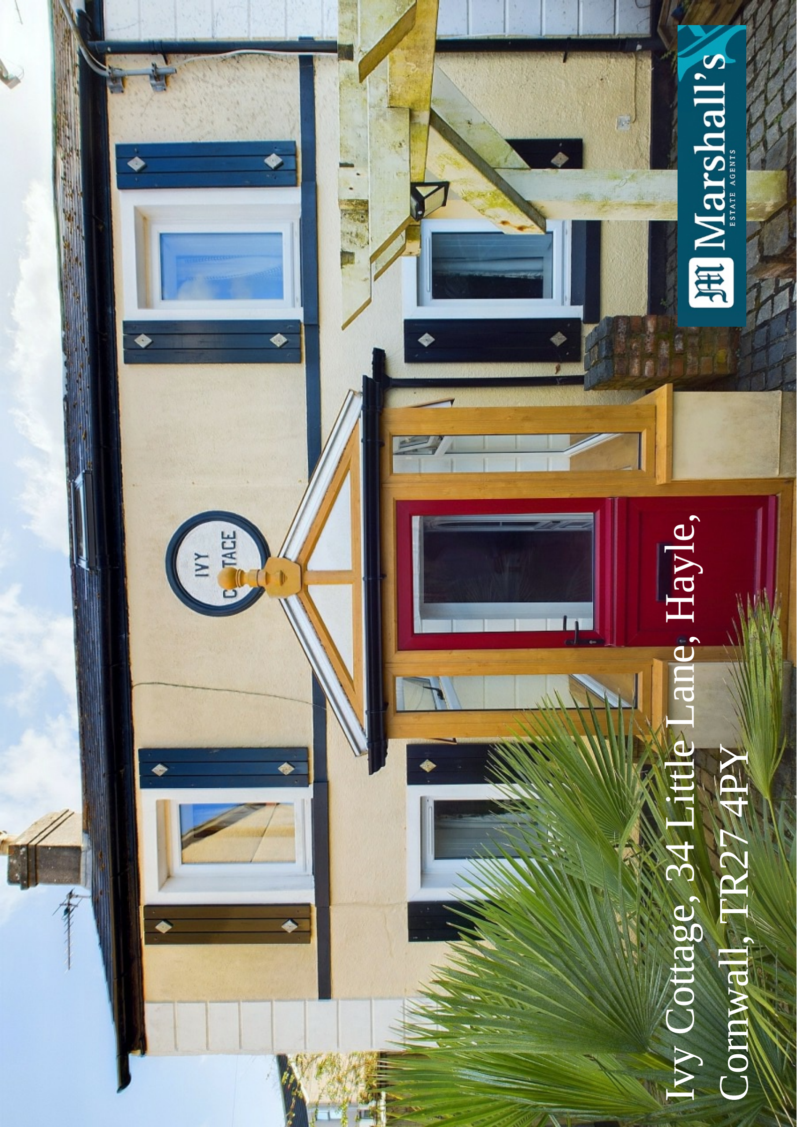
Ivy Cottage, 34 Little Lane, Hayle, Cornwall, TR27 4PY