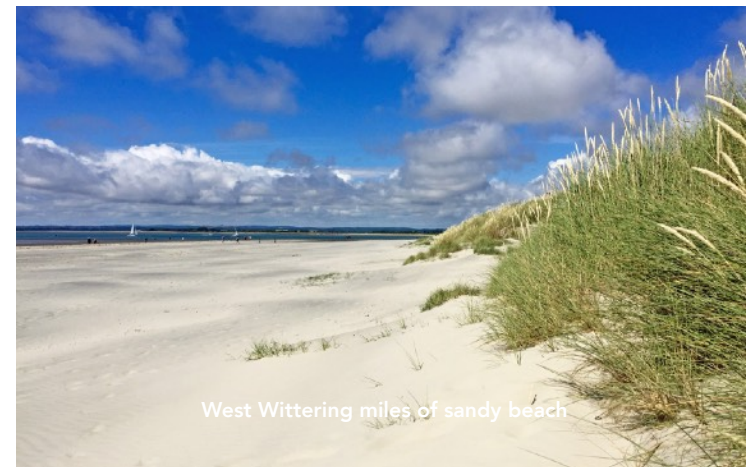
West Wittering miles of sandy beach

LOCAL AUTHORITY: Chichester Council 01243 785166