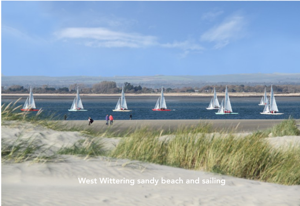
West Wittering sandy beach and sailing