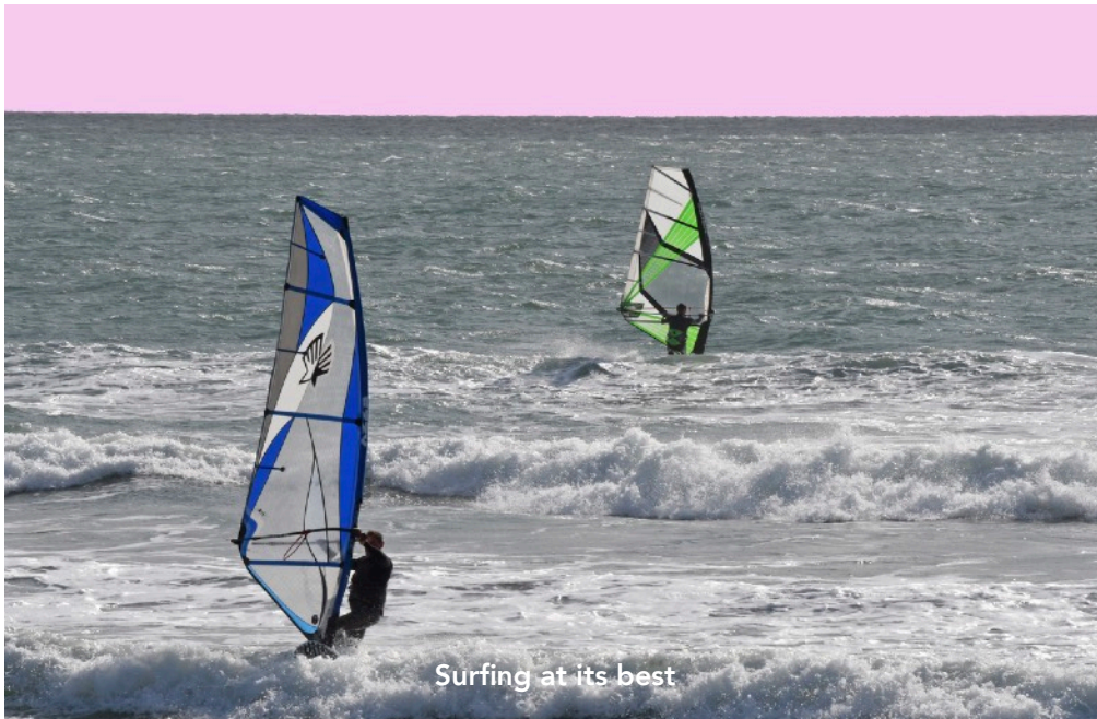
Surfing at its best

A stunning superbly appointed individually designed detached stylish house, built in 2019 to a high specification with light and spacious accommodation, including 4 double bedrooms, 3 bathrooms (2 en-suite), superb kitchen/dining/family room, fabulous principle bedroom with vaulted ceiling and south facing Juliet balcony, located just a short walk to the beach.