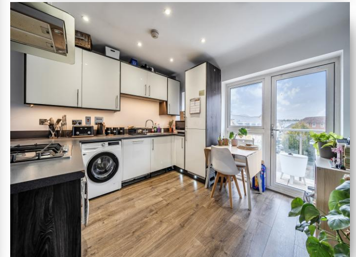
8 Hayfield Court, 26 Brambling Way, Maidenhead SL6 8PQ