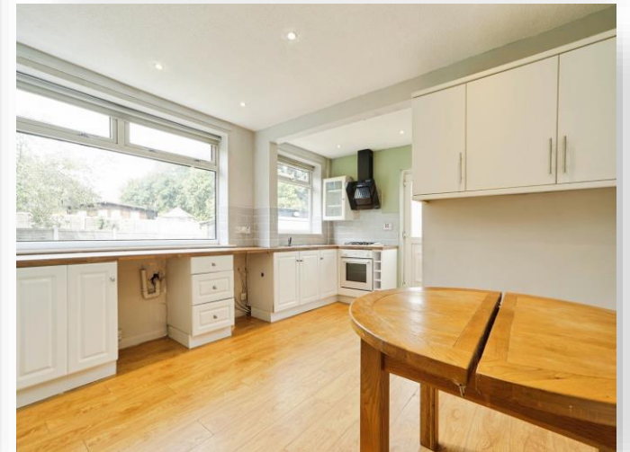
Lickless Terrace, Horsforth Leeds LS18 5QG