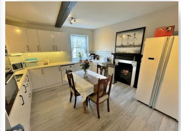
Old Market, Wisbech PE13 1NJ