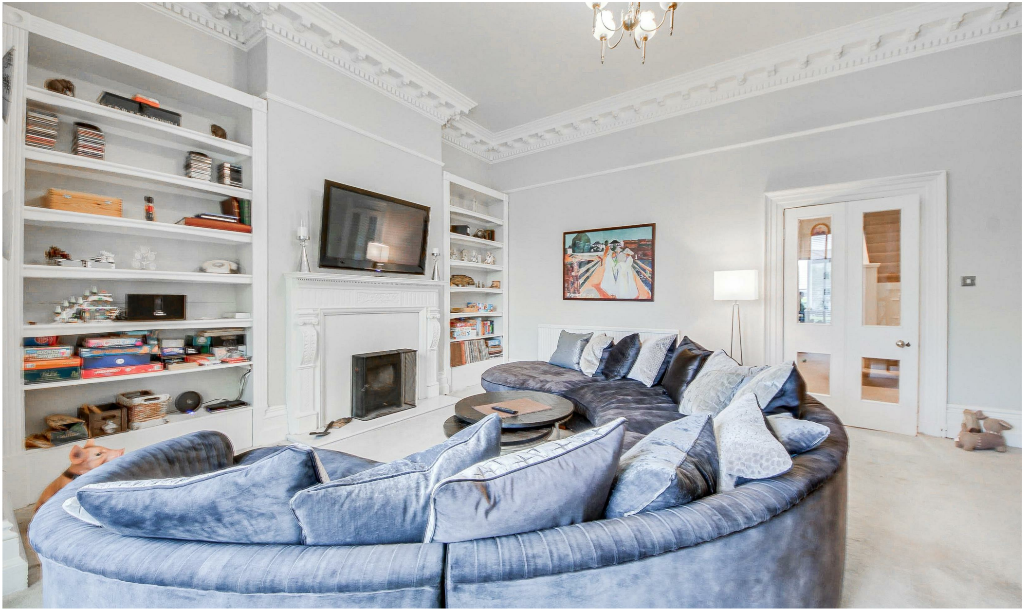
GOLF | CHARLOTTE HOUSE, GROUND FLOOR, 35-37 HOGHTON STREET, SOUTHPORT, MERSEYSIDE, PR9 0NS