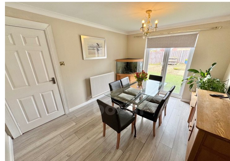
Rousay Wynd, Kilmarnock