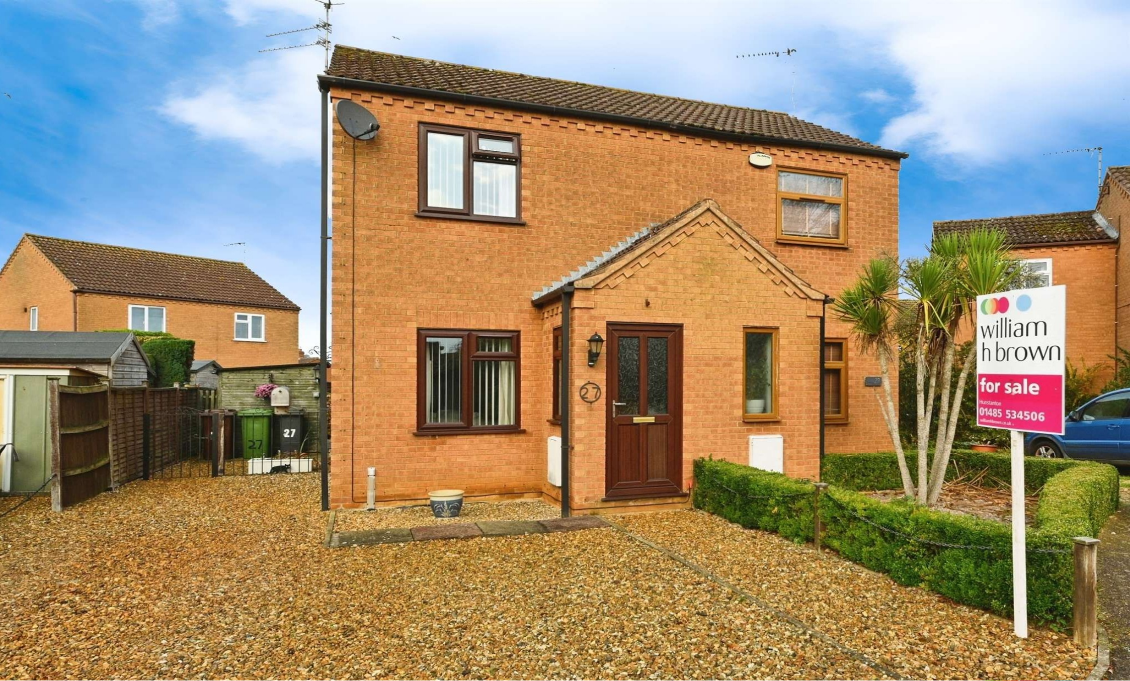
Burma Close, Dersingham, PE31 6YY