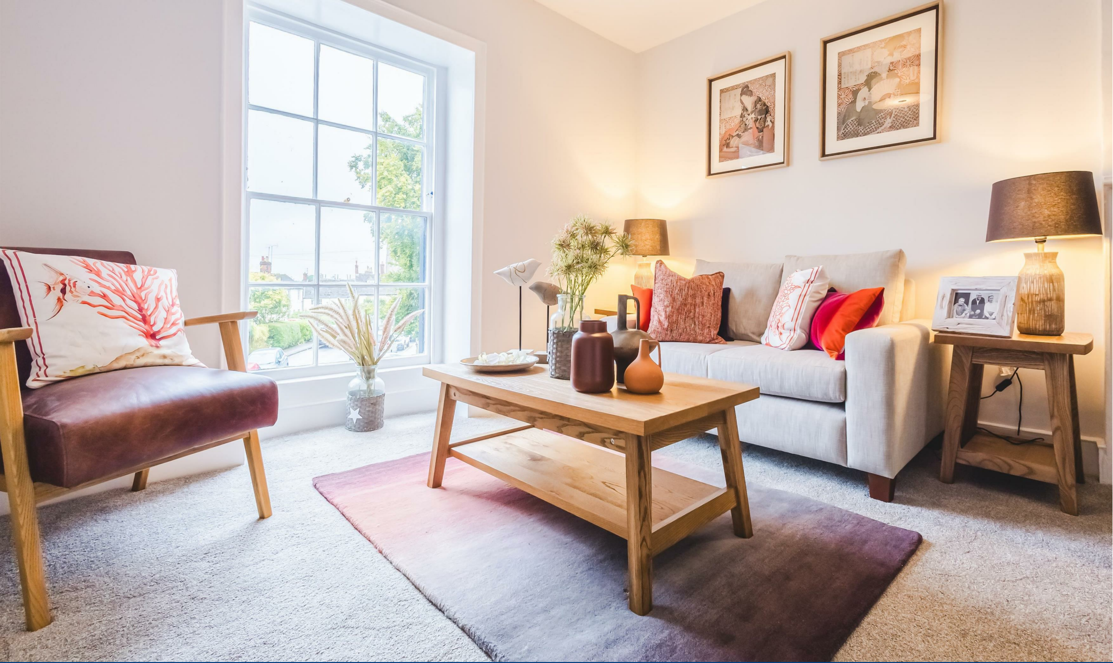
White Hart Mews, Calne £300,000