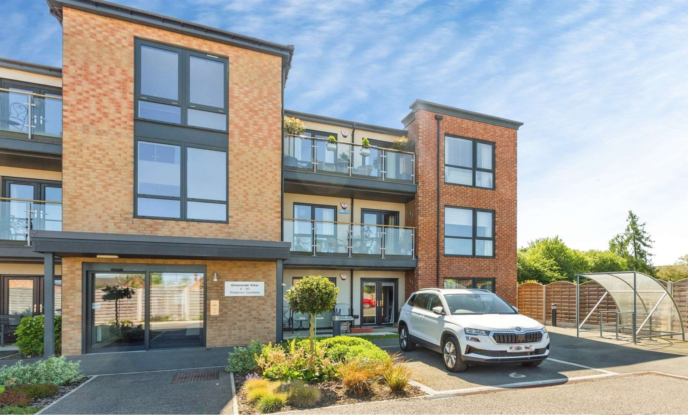
Waterton Gardens, Walton Wakefield WF2 6UH