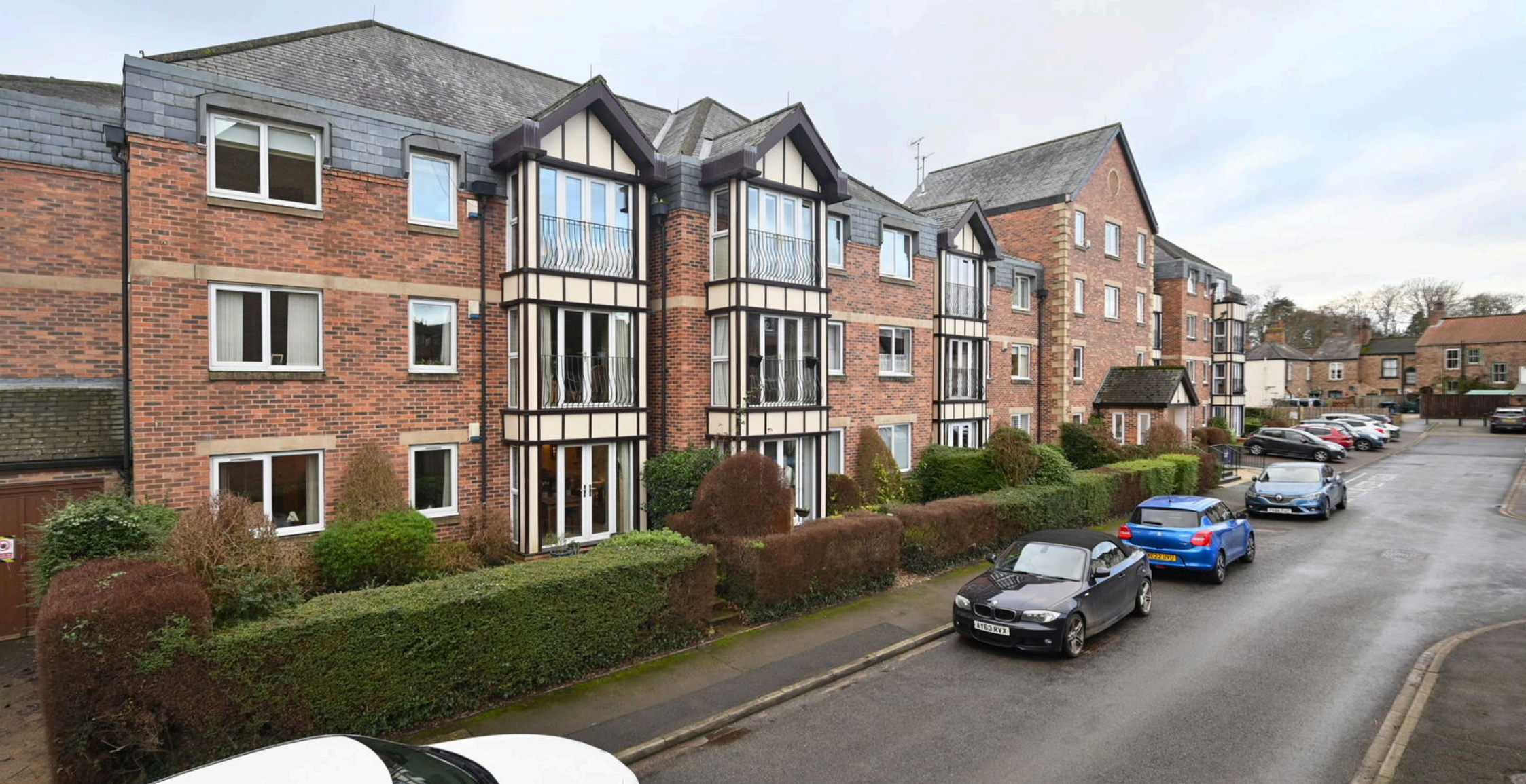
Riverside House, Williamson Close, Ripon, HG4 1AZ