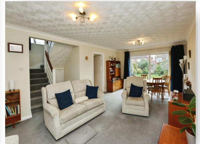
South Close, Gosport PO12 2PS