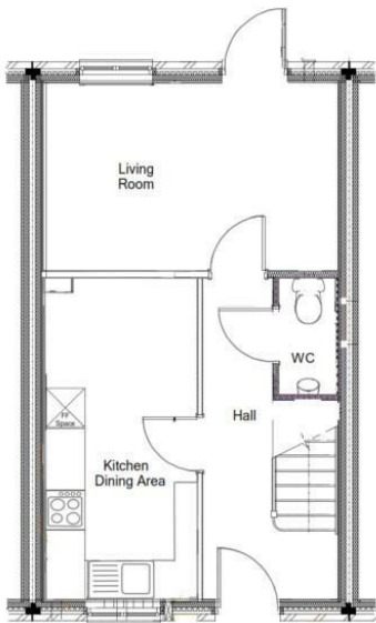
Ground Floor Living Room 2.96m x 4.62m Kitchen Dining Area 2.34m x 5.03m

All measurements are approximate. We have not checked the serviceability of any appliances, fixtures or utilities (i.e. water, electricity, gas) which may be included in the sale. We cannot guarantee building regulations or planning permission has been approved and all prospective purchasers should satisfy themselves on these points prior to entering into a contract. Consumer Protection from Unfair Trading Regulations 2008. The Agent has not tested any apparatus, equipment, fixtures and fittings or services and so cannot verify that they are in working order or fit for the purpose. A Buyer is advised to obtain verification from their Solicitor or Surveyor. References to the Tenure of a Property are based on information supplied by the Seller. The Agent has not had sight of the title documents. A Buyer is advised to obtain verification from their