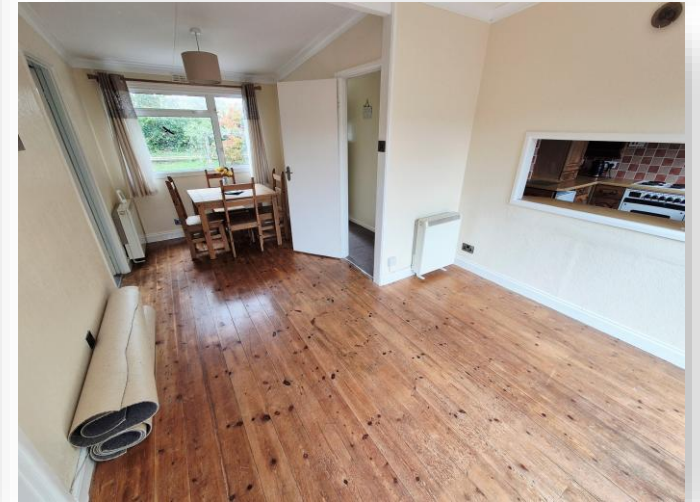
Cleeve Park, Chapel Cleeve, Minehead, TA24 6JG