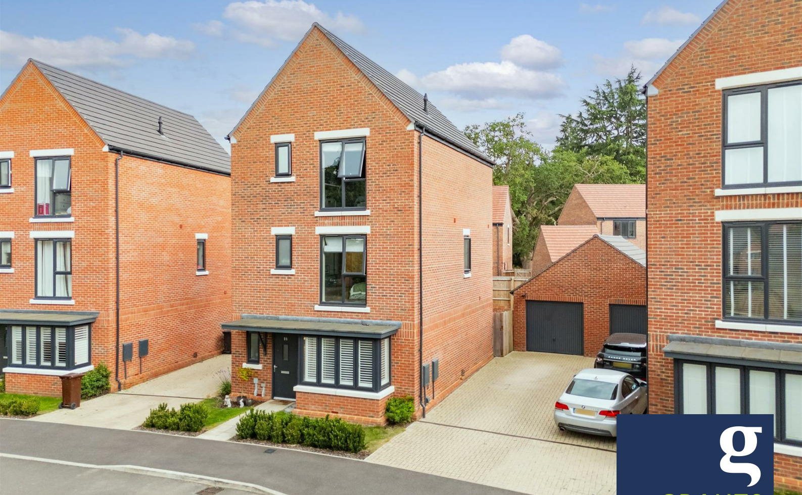
Nightingale Avenue, Ottershaw, KT16 0SA