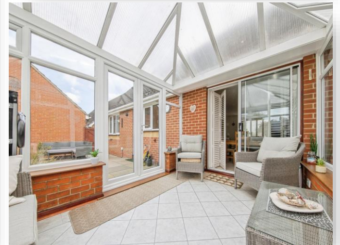
Gippingstone Road, Bramford, Ipswich, IP8 4DR