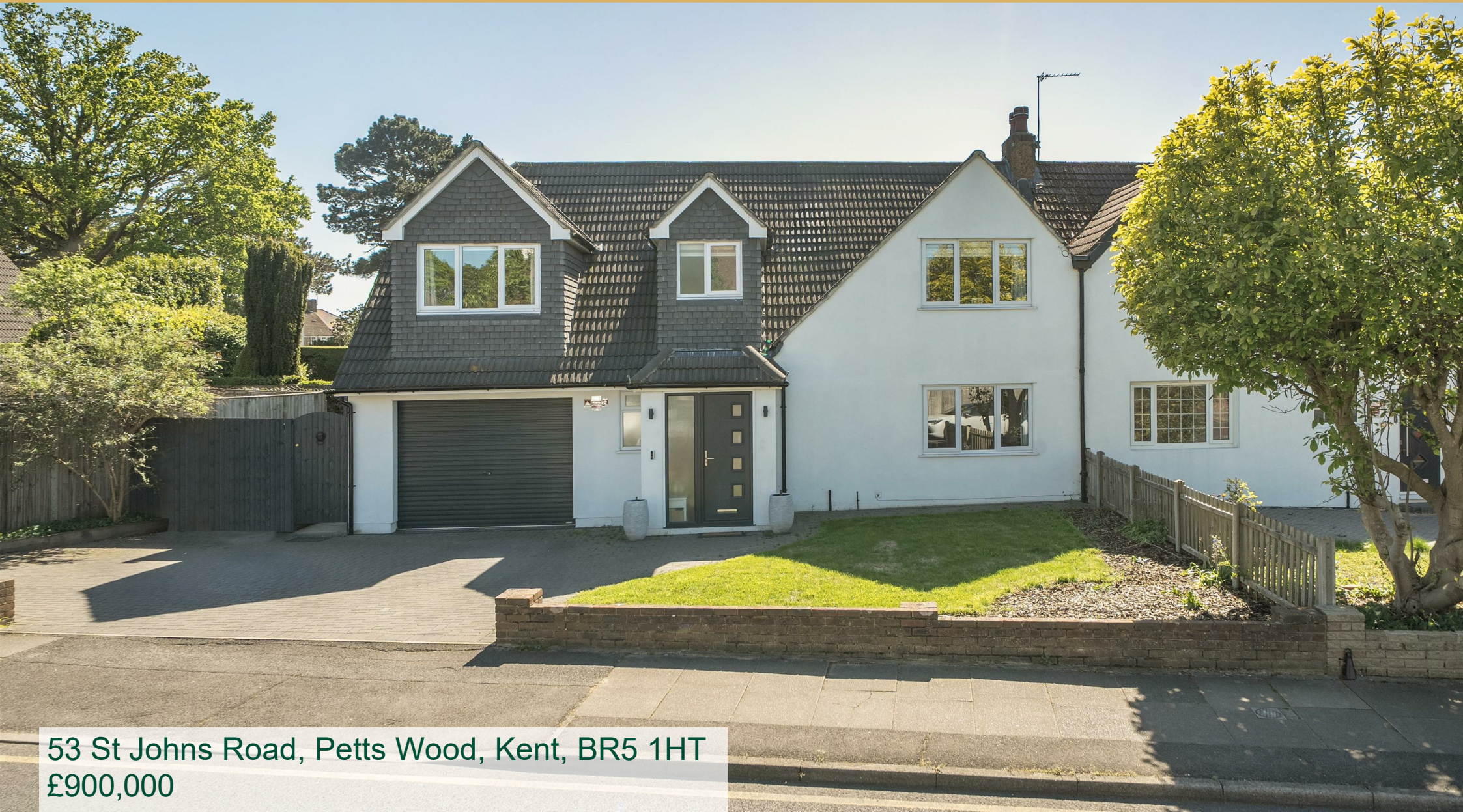
53 St Johns Road, Petts Wood, Kent, BR5 1HT £900,000