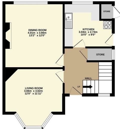
GROUND FLOOR 42.5 sq.m. (457 sq.ft.) approx.