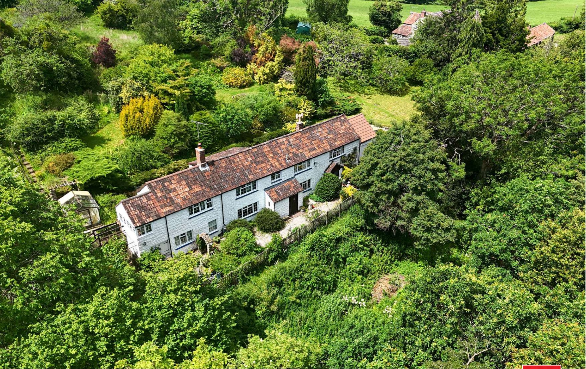
Priorscombe House Corfe, Taunton TA3 7DF