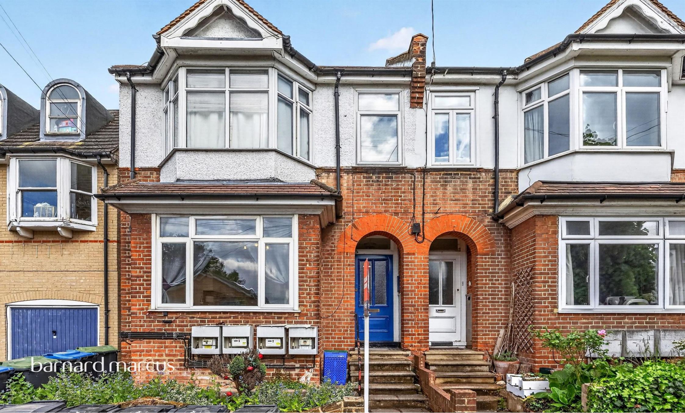
Glossop Road, South Croydon CR2 0PU