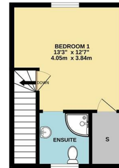
2ND FLOOR 254 sq.ft. (23.6 sq.m.) approx.