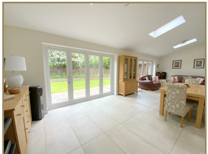
7 The Glade, New Waltham, North East Lincolnshire, DN36 4FS £575,000