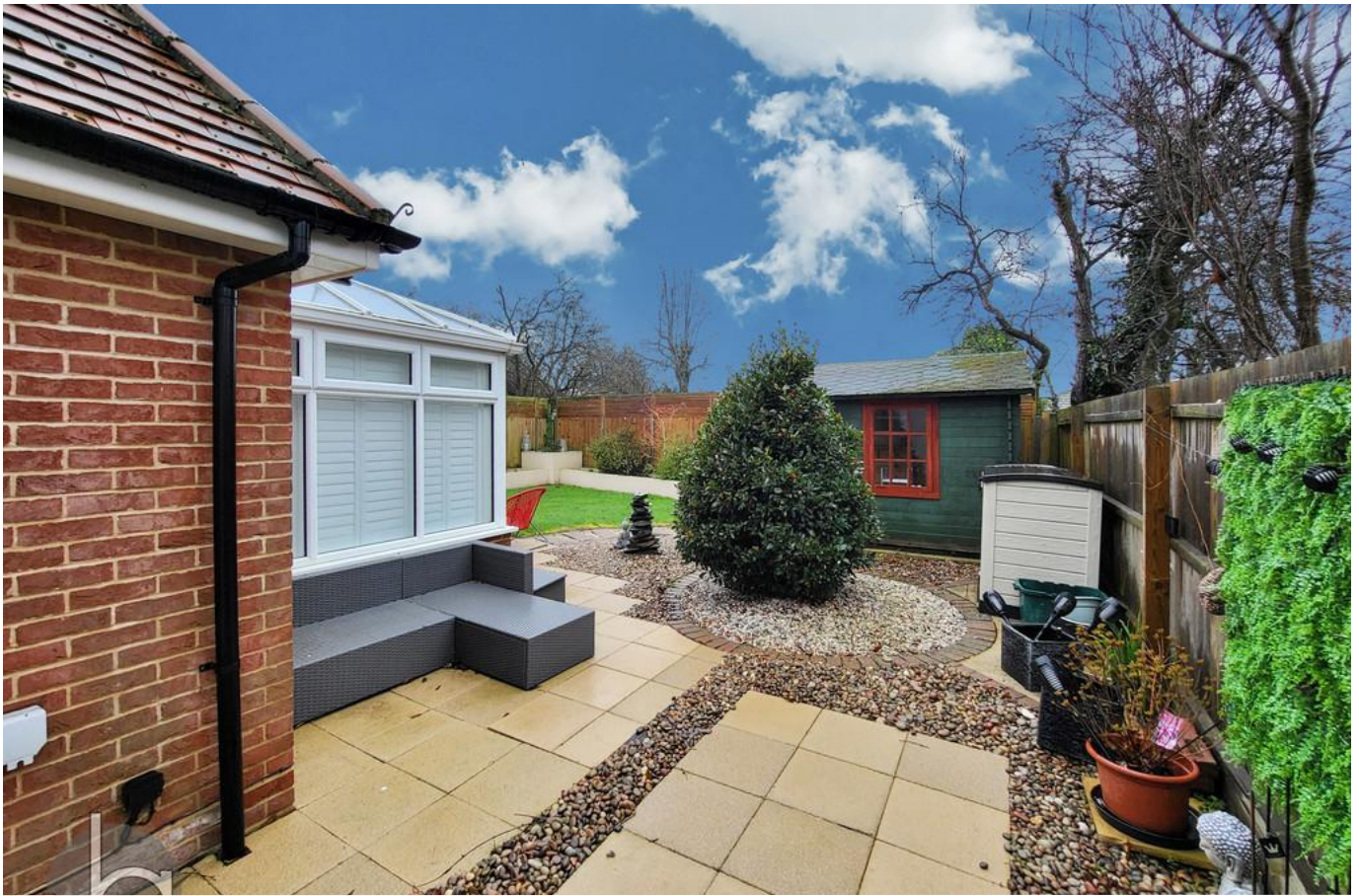
The Mews, West Mersea CO5 8GW