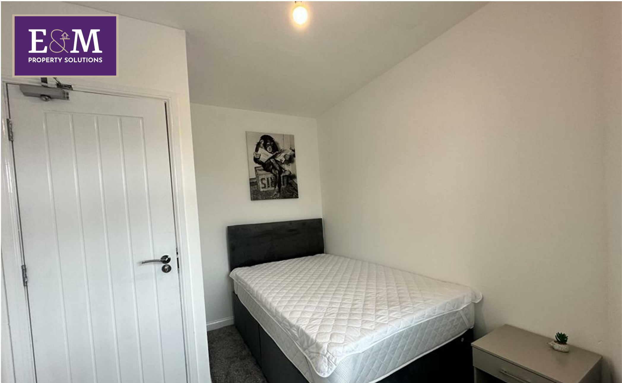
ROOM 5, 369 Brunshaw Road, Burnley, Lancashire, BB10 3HX £85 Per week