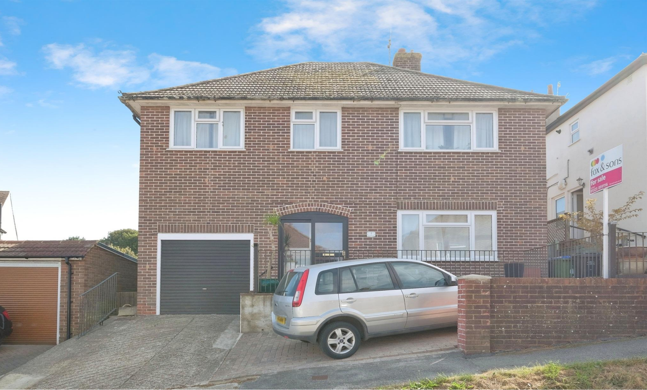
Rose Walk Close, Newhaven, BN9 9NL