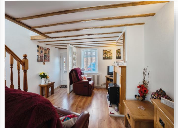
Mona Street, Cloughton, Birkenhead, CH41 0ED