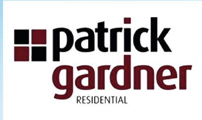
Pemberley The Marld, Ashted, Surrey, KT21 1RW