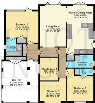
Floor Plan Floor area 108.0 sq.m. (1,163 sq.ft.)

The Pinford, 11 Trelawny Way, Bembridge, PO35 5YE