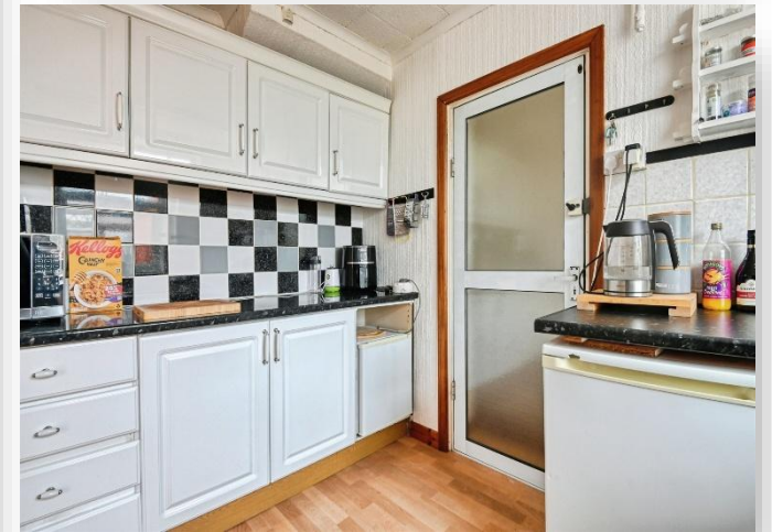
School Lane, Buckland End, Birmingham, B34 6SH