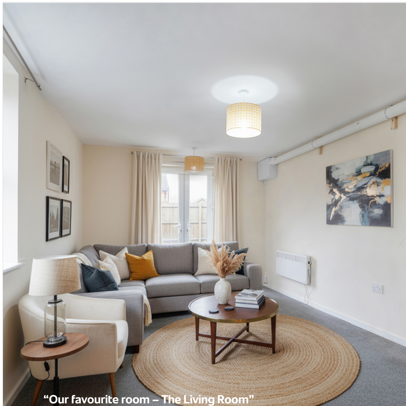
"Our favourite room – The Living Room"

"We love to open the French doors and let the fresh air inside the flat in the summer. The living space feels quite private and we have enjoyed relaxing, drinking our morning coffee to prepare for the day ahead."