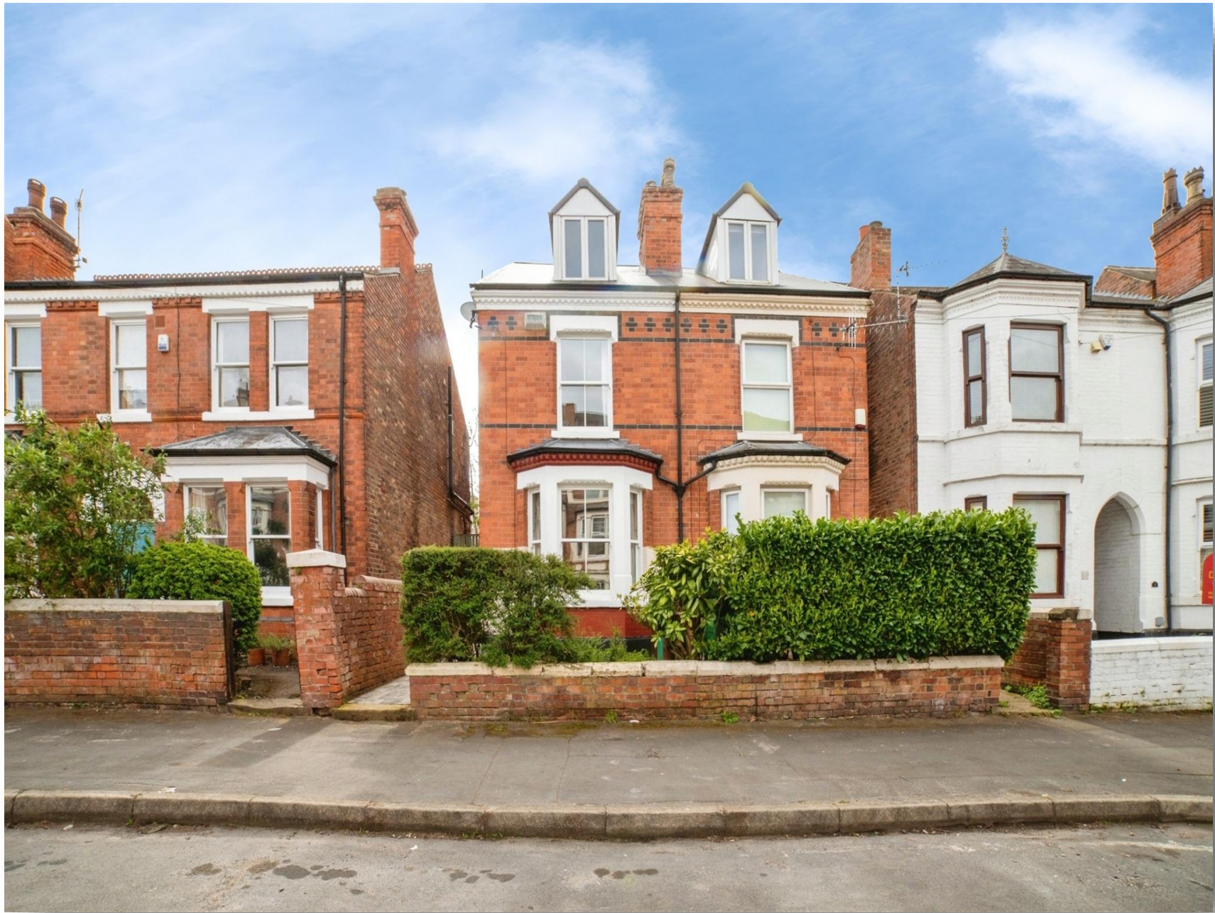
Waldeck Road, Nottingham NG5 2AF