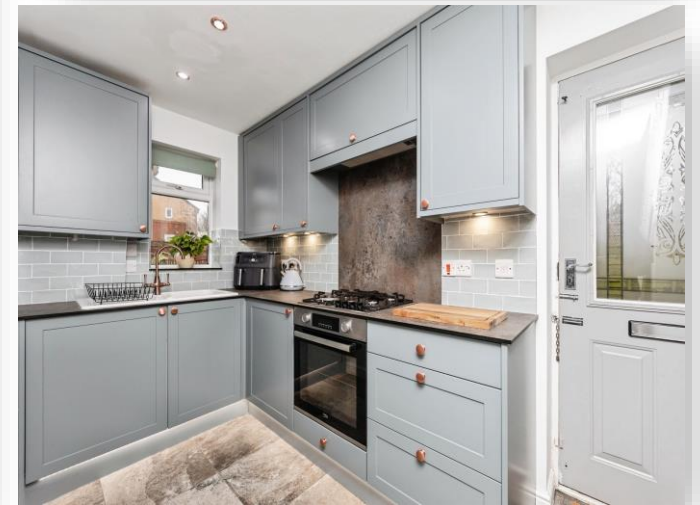
Kingfisher Mews, Morley Leeds LS27 8GT