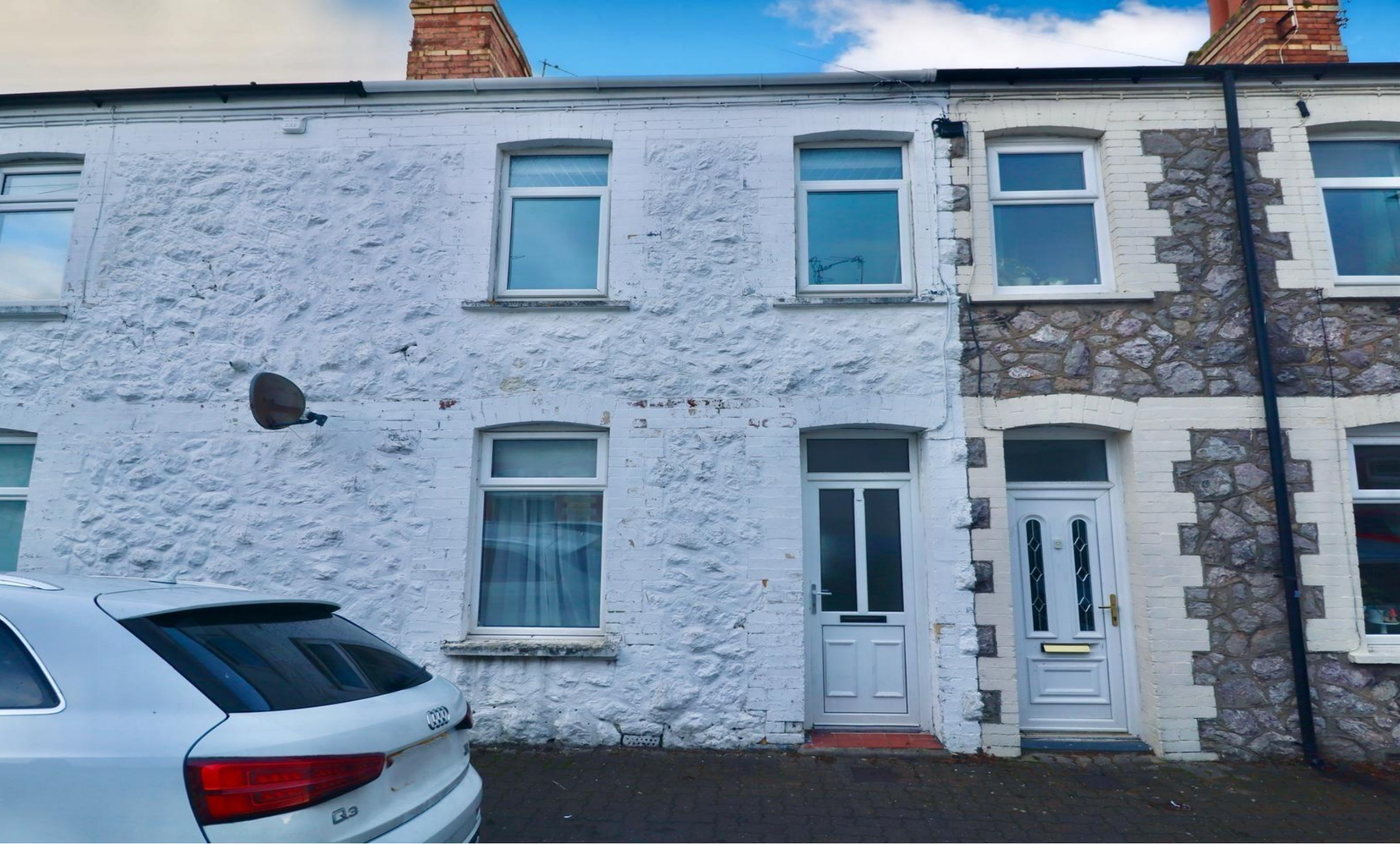
Llewellyn Street, Barry CF63 1BZ